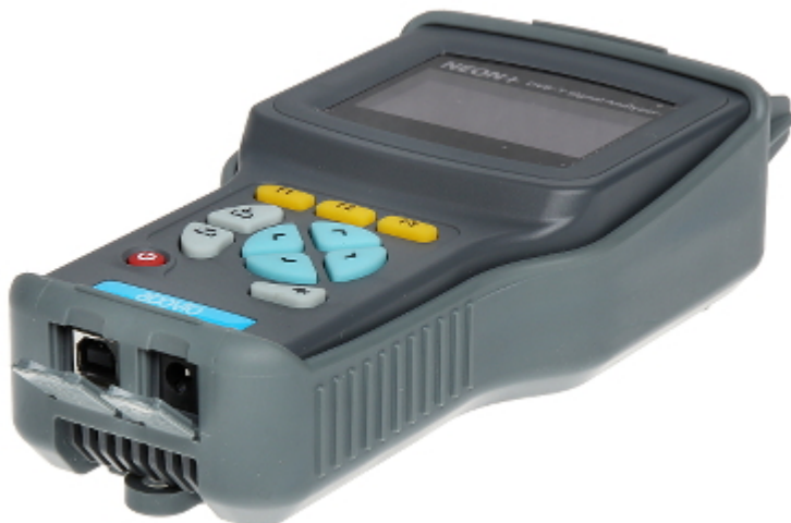
Top view (input connector visible):